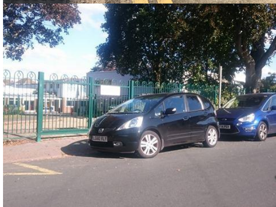
Parking across our emergency gates