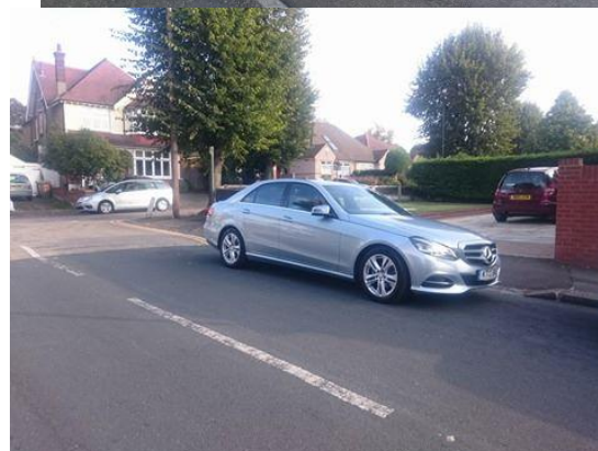
Blocking neighbours driveways